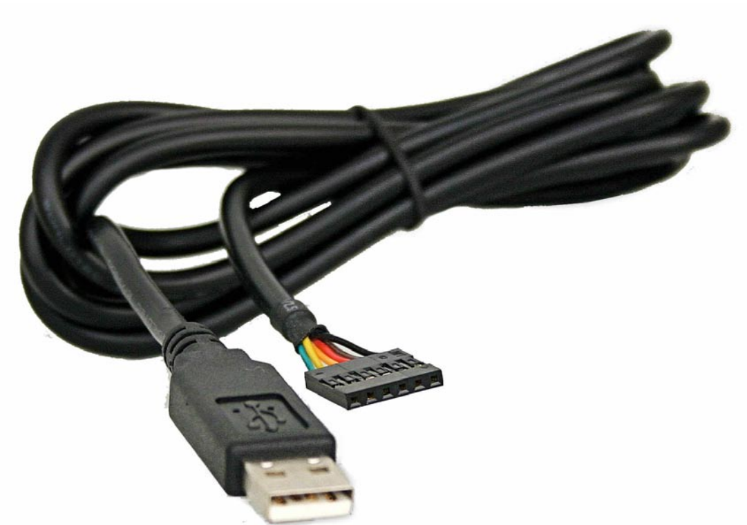
Figure 1 - The TTL-232R USB to TTL Serial Converter Cable.